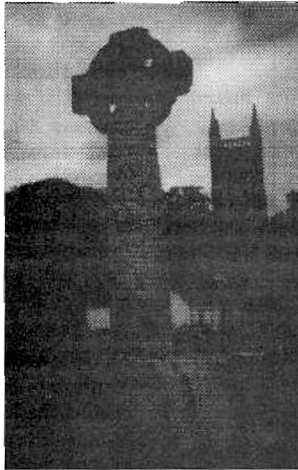
Intricately sculptured Celtic Cross at Drumcliffe, Co. Sligo.

Do not forget to let us know in your next what requisites will be necessary to bring with us and if farming implements are cheap and easy to get.