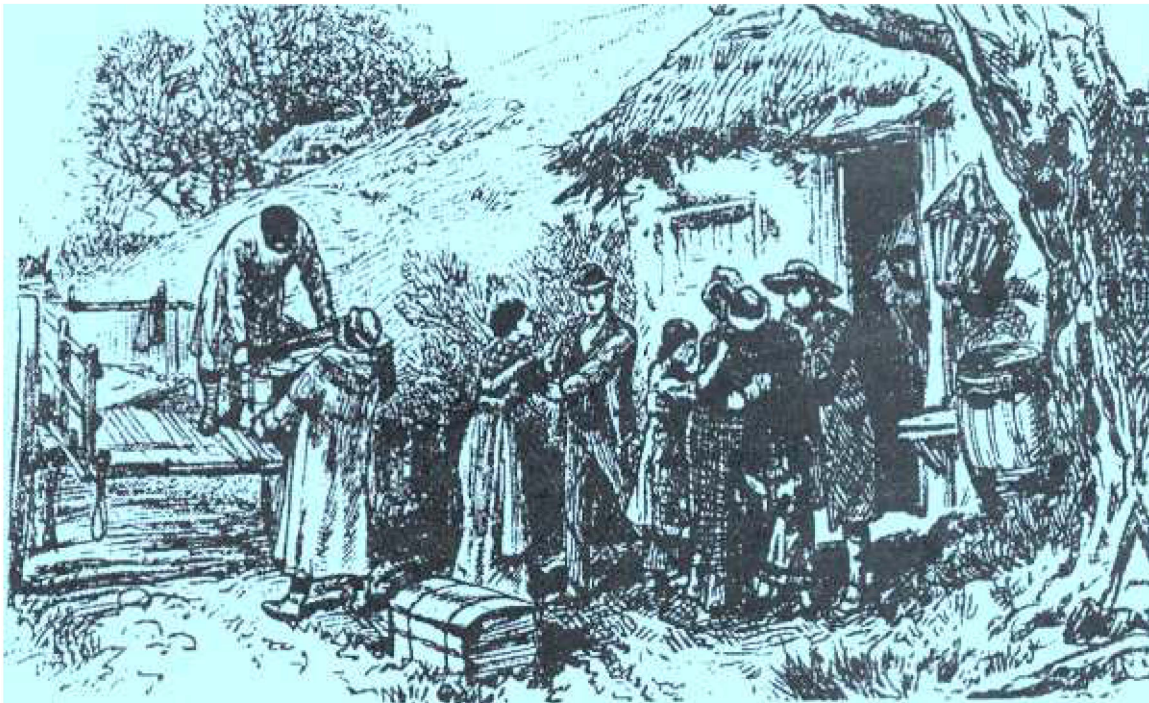
Emigrants leaving home in the west of Ireland.