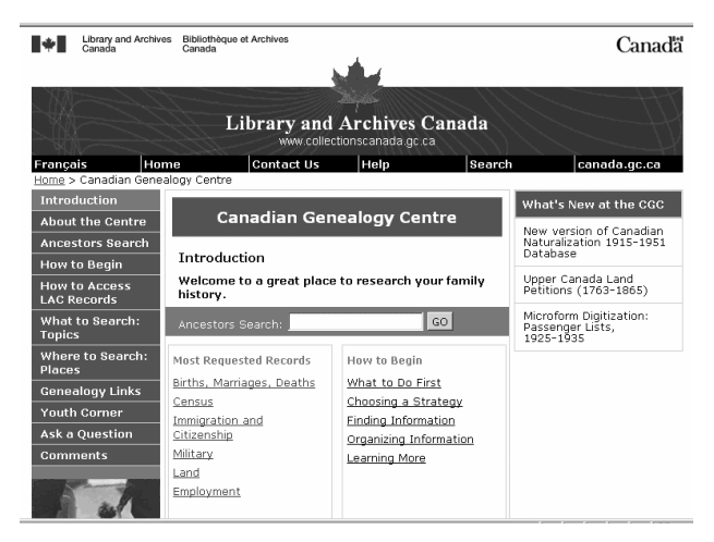
Figure 1: Canadian Genealogy Centre home page

If you happen to be in Ottawa, please visit the consultation room located on the third floor at 395 Wellington Street. You can discuss your research with a genealogy consultant and come up with a strategy to find relevant sources to further complete your family tree. You can access some subscription databases such as an institutional version of Ancestry.ca, BMS2000 and Mes Aïeux. There are also two terminals loaded with popular genealogy databases on CD-ROM, as well as some databases that will eventually be available on our website.