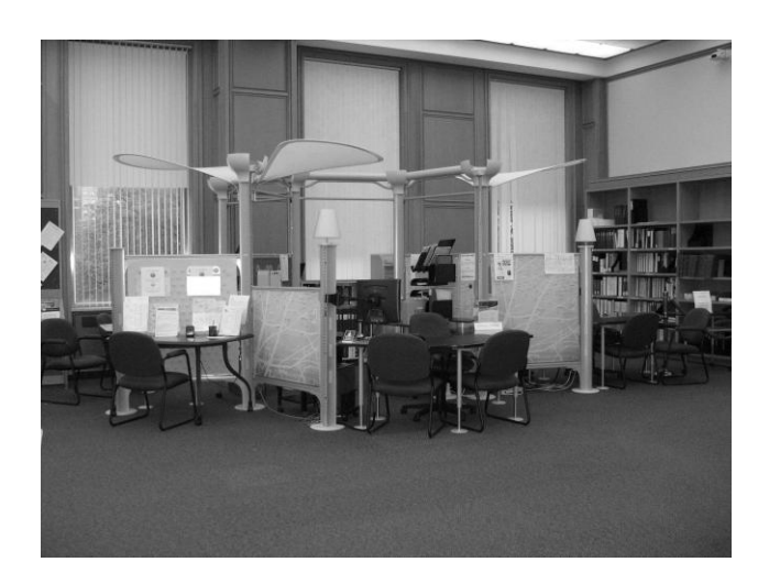
Figure 2: Consultation Room

We invite you to explore the Genealogy Services website of Library and Archives Canada to discover a wealth of Canadian genealogical sources: www.collectionscanada.gc.ca/genealogy.