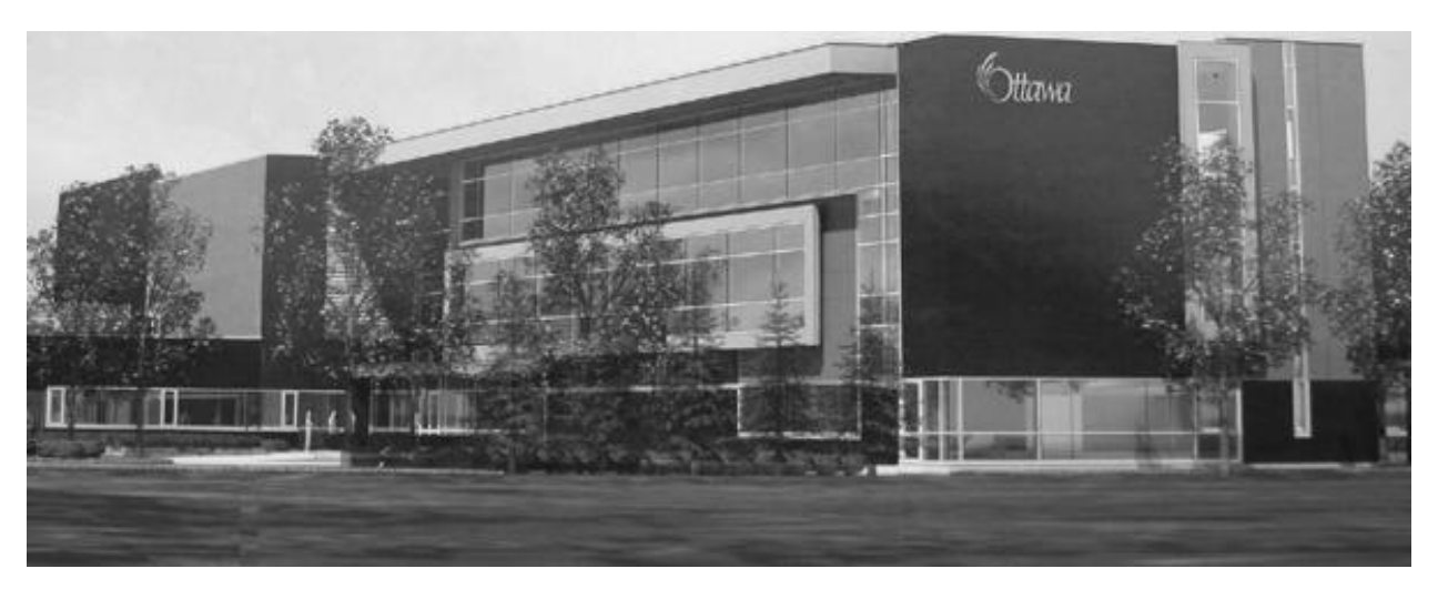
Figure 3: New Ottawa City Archives Building

Because of its central location in the geographic heart of the new municipality, vacant city-owned property at the corner of Woodroffe Avenue and Tallwood Avenue was chosen as the site of the building. An architect was chosen, plans were drawn up and the first sod turned 23 October 2009. Throughout its construction, the building was on time and under budget. At the time of writing, the City of Ottawa Archives and its partner libraries are poised to move into this fine new building when it opens 10 June 2011.