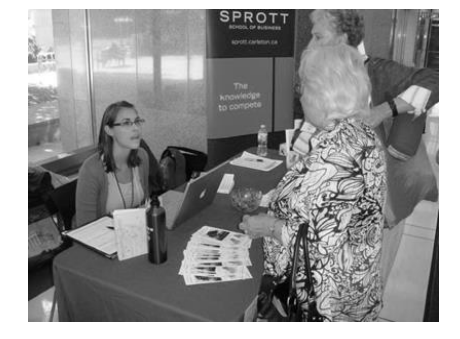
Carleton's Canadian Genealogy Survey is explained to registrants

The overflowing Marketplace offered such useful information as historical publications, CDs, research guides and historical society membership; it was a busy area throughout the conference. Attendees also enjoyed the lunches served in the LAC cafeteria and the traditional Saturday dinner at the Bay Street Bistro.