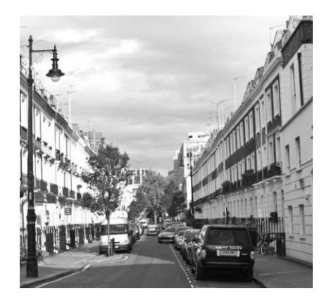
Figure 6: General view of Hugh Street, Pimlico

Out of curiosity, I dug out the letter that my correspondent had written to me in 1995. It was typed on personal letterhead. The collector's address was—wait for it—10 Hugh Street!