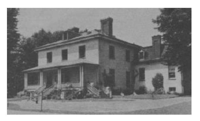
Figure 1: Fairknowe Home ca. 1910

The situation of Fairknowe home, at Brockville, is even more delightful, being separated by a roadway only and a grassy slope, studded with handsome residences, from the beautiful St Lawrence. This property also comprises an adapted private residence, of good size, though none too large for the purposes it has to serve, the usual outbuildings and sixteen acres of land, of which a considerable area is timbered.