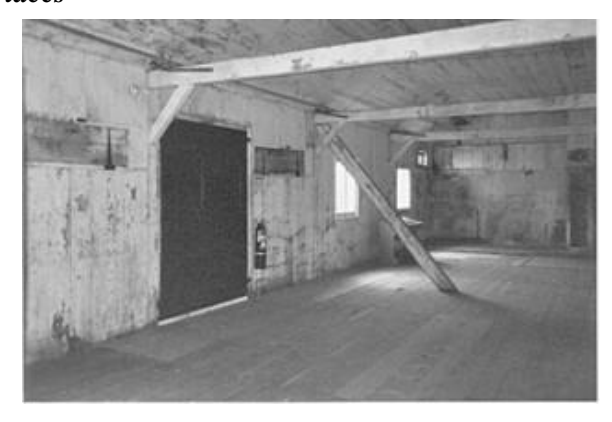
Figure 2: The quarantine shed at Grosse Île

To get a better sense of your ancestors and their community, an illuminating route to take is to investigate places personally known to them. Many of those in my ancestors' Irish Montréal community had a connection to the Grosse Île Quarantine Station. Situated on an island in the Saint Lawrence River, east