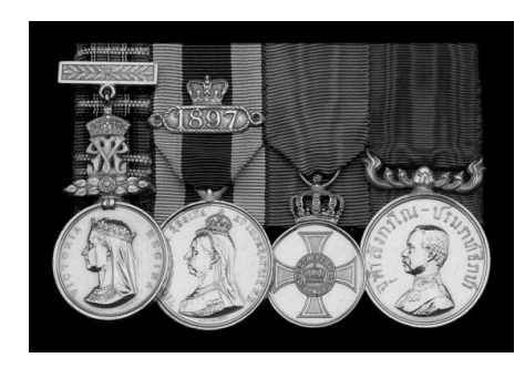
Figure 5: Edwin Miller's medals

2008. What's more, there was a wonderful photograph of Edwin's medals on the website (Figure 5), so now I know what they look like! <sup>10</sup>