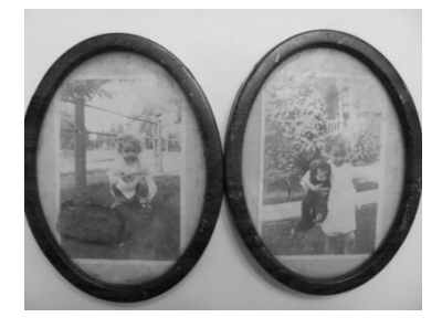
Figure 1: The mystery pictures As I live just two hours away from Ottawa, my next step was to order Alma and Uberto's service files and go take a look at them personally. Serendipitously, the day I had arranged for the visit was the same

I decided to start by seeing if there was a copy of Alma's Attestation paper at Library and Archives Canada.<sup>1</sup> Sure enough, Alma's was there, and Uberto's too, and these first documents became the foundation for my great-aunt's story.