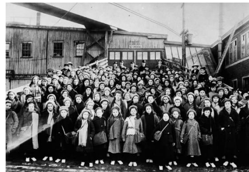
Home children, St. John, NB. c.a. 1920

Checkout BIFHSGO's best-known website collection—its extensive indexes of home children records, including records from Dr. Barnardo's, Middlemore, immigration records prior to 1892, Fegan Homes and photos from St. George's Home in Ottawa.